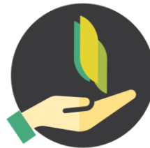
Process Flows Platform